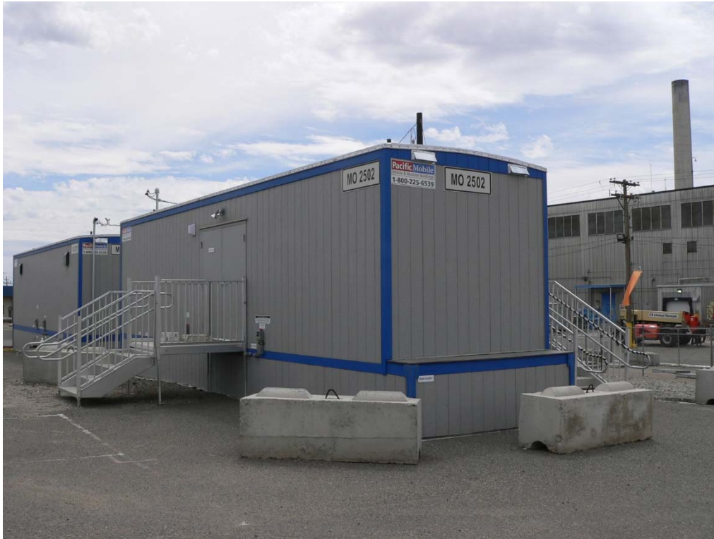
Figure 1. MO2502 Pre-Demolition