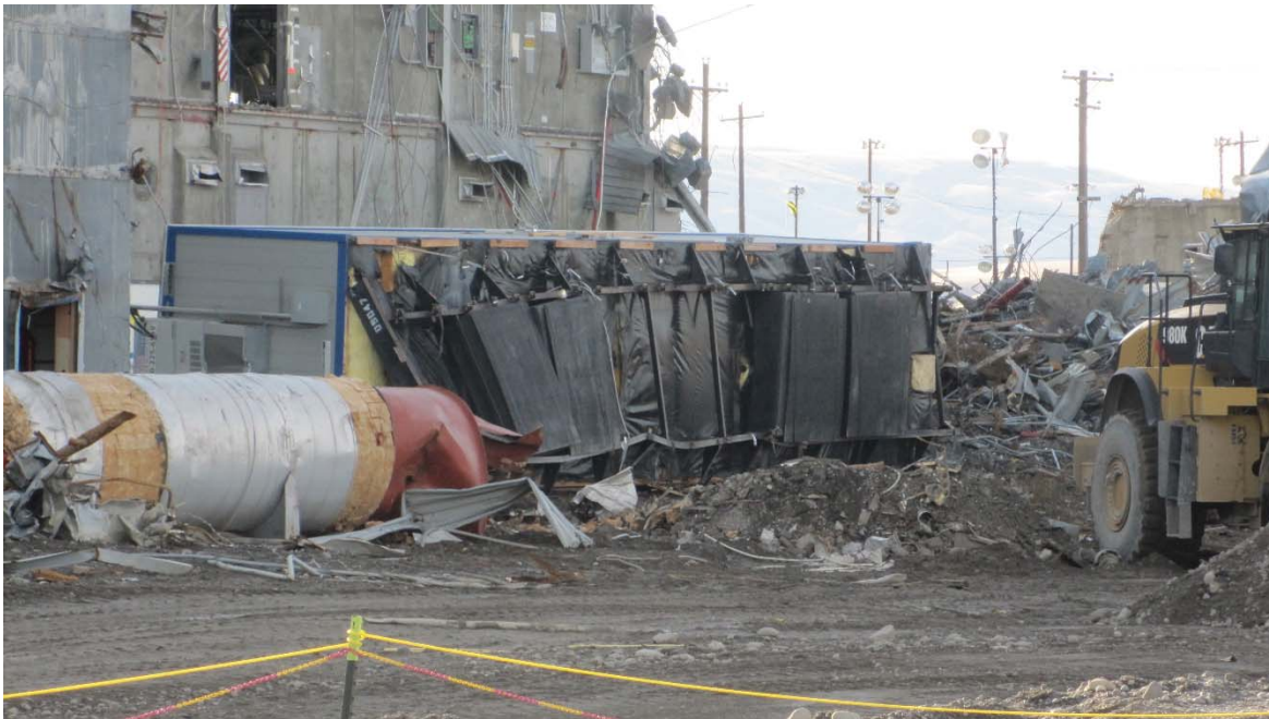
Figure 2. MO2502 During Demolition