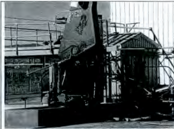
4/19/07 – Demolition of 241-ZB Structure