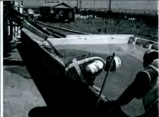
5/17/07 – Adding CDF to 241-ZB Basins