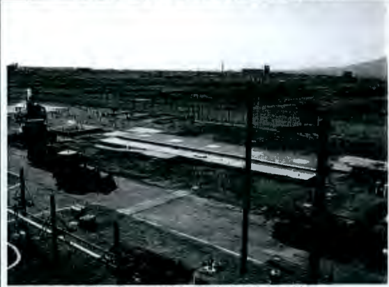
5/14/07 – 241-Z Slab Clean Up