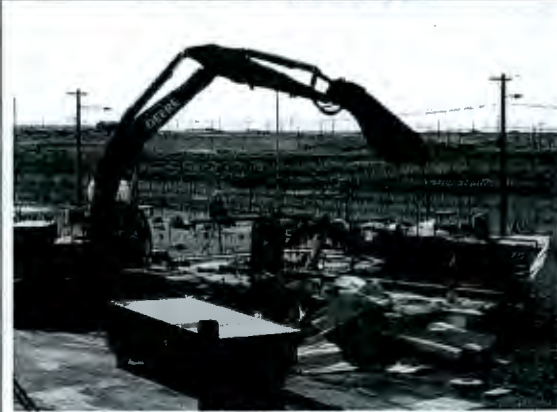
5/10/07 – Size Reducing 241-Z Rubble