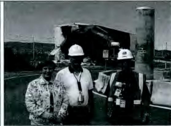
5/07/07 – J. Ayres Site Visit