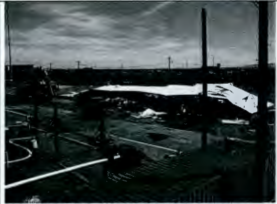
5/07/07 – 241-Z Structure Dropped