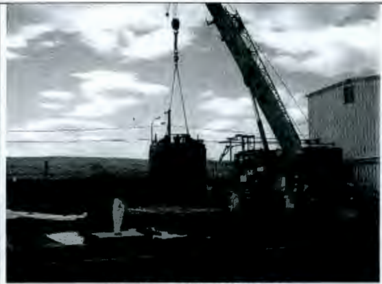
4/24/07 – Lifting Tank D9