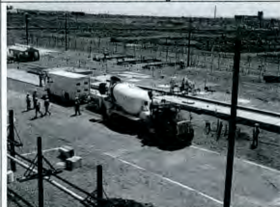
5/17/07 – Adding CDF to Cell D6 Floor