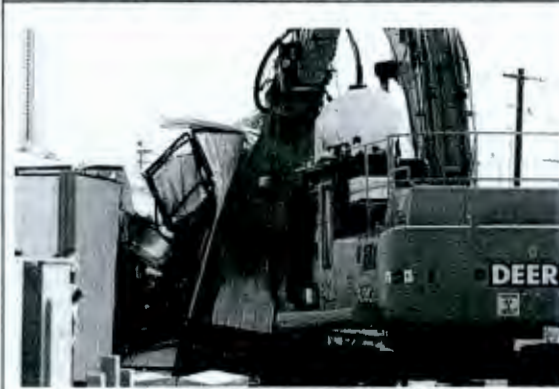
4/26/07 – 241-Z Annex Demolition