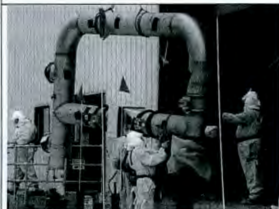
5/01/07 – Loading Out Upstream HVAC Duct