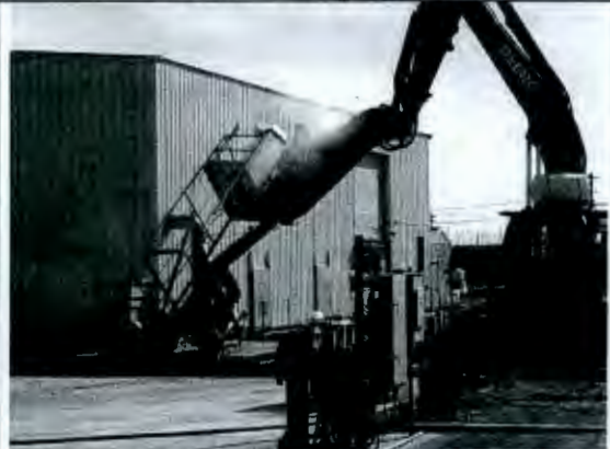
4/27/07 – 241-Z Stack Demolition