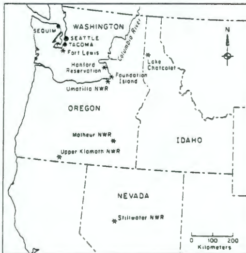
Figure 1. Great Blue Heron collection sites in the northwestern United States; stars indicate nesting colonies, 1977-82.

ervation), McNary Recreation Area (Foundation Island) on the Columbia River, and the Fort Lewis Military Reservation (Fort Lewis) near Puget Sound. Egg collections were also made at the Umatilla National Wildlife Refuge (NWR) on the Columbia River in both Washington and Oregon, two Oregon colonies