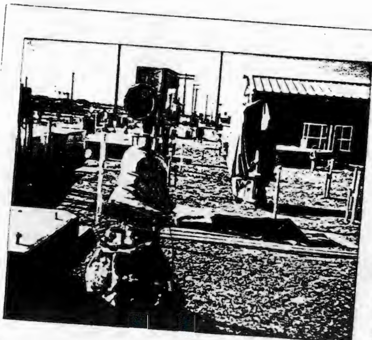
101 A2 FIC