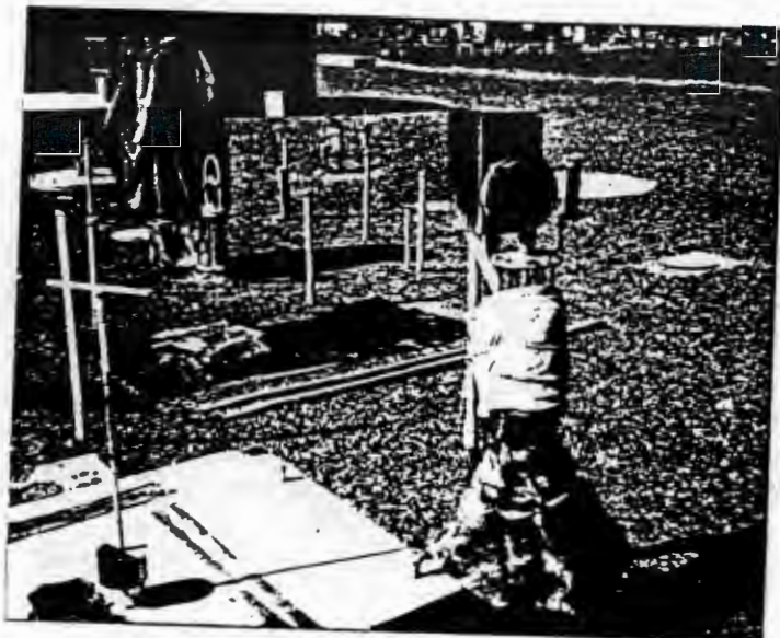
101 A2 FIC

12345678910111213141516171819202122232425262728293031 OCT 1991 RECEIVED EDMC