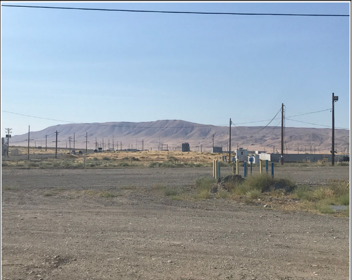
MO2177 post-demolition, looking south