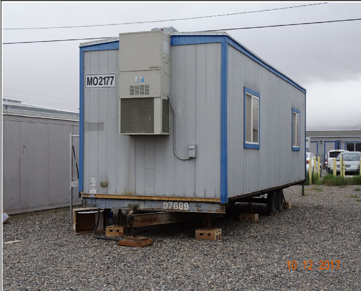
MO2177 pre-demolition, looking south