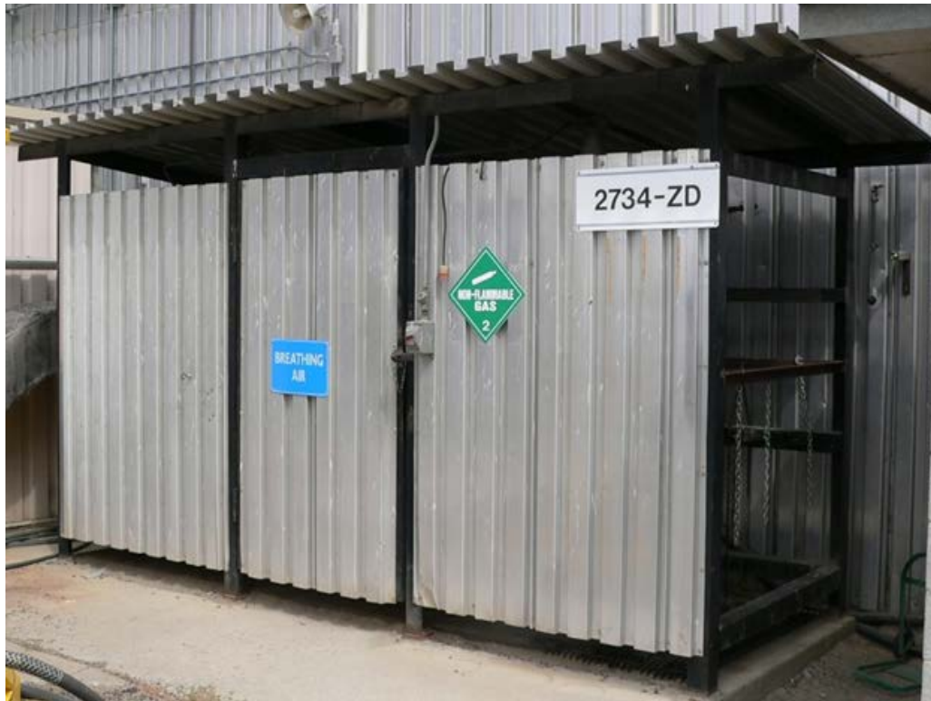
Figure 2. 2734ZD Pre-Demolition