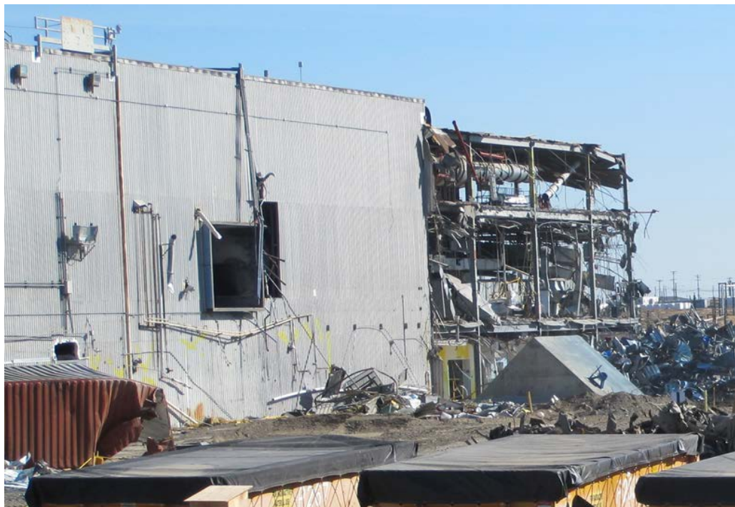
Figure 3. 2734ZD Post Demolition