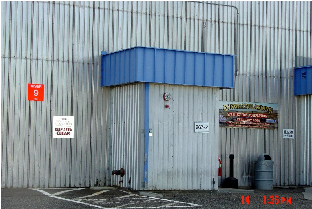
Figure 1. 267Z Pre-Demolition