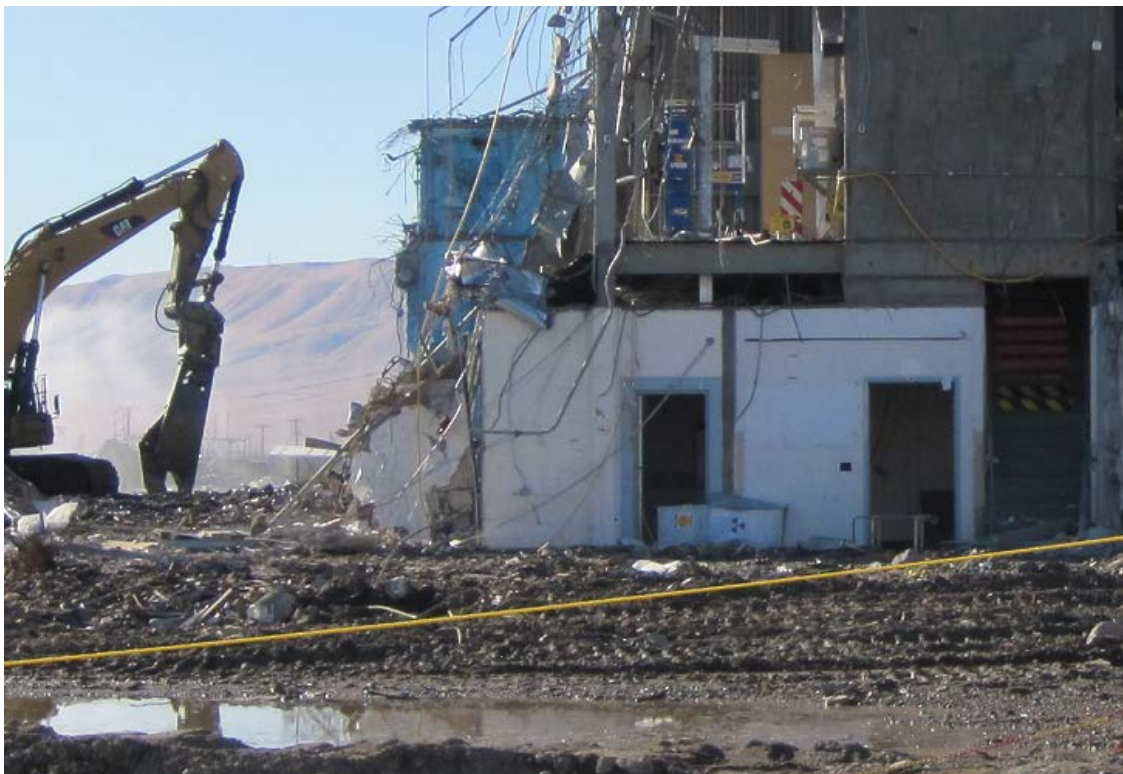
Figure 2. 267Z Post Demolition