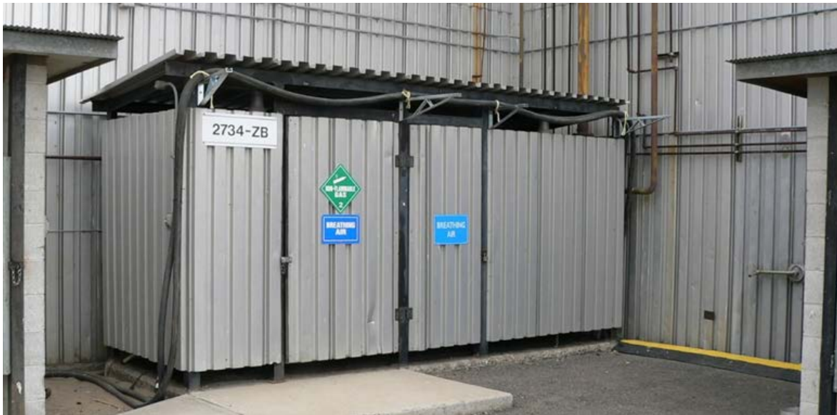
Figure 2. 2734ZB Pre-Demolition