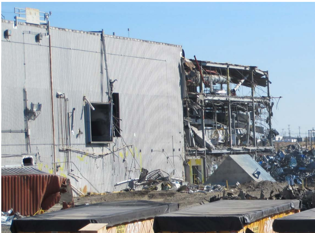
Figure 2. 2734ZL Post Demolition