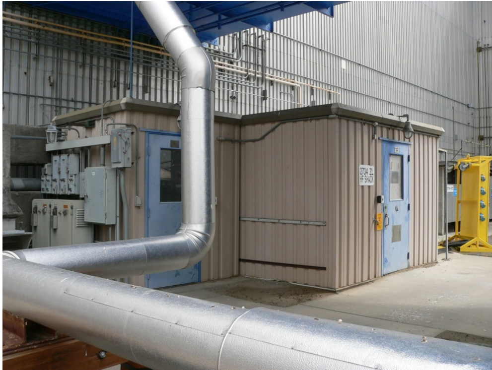
Figure 1. 2734ZL Pre-Demolition